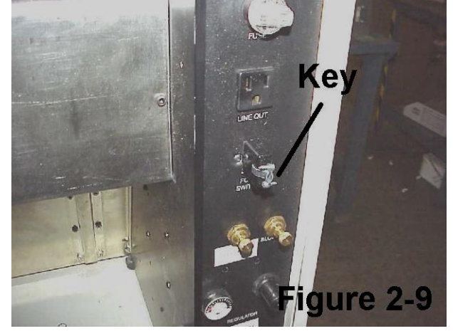
CAUTION! Ensure your fingers are not in the seal area when pressing the footswitch or guard switch or your fingers may be pinched or burned by the closing seal bar.

Once the bag is sealed, pull downward until the next empty bag is in the seal position, load the bag and continue the seal process.