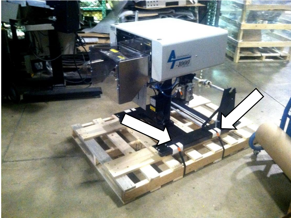
Securely Band T-1000 to skid