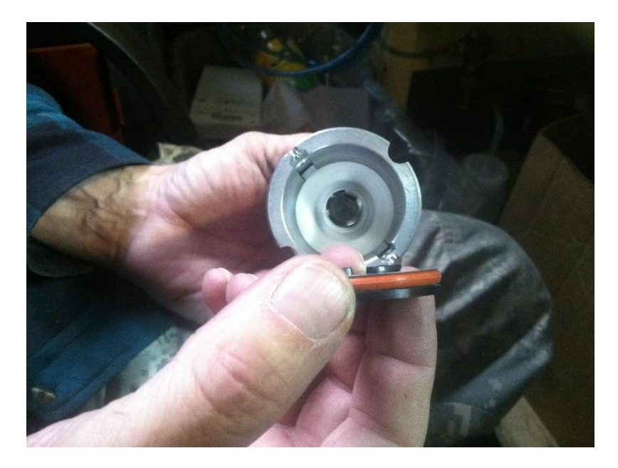
#3 is next; orange O ring side against #2

Put Nylon piece in #2. Note: the notches must line up.