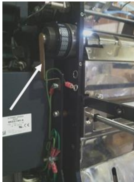
Remove Old Ground Sensor.