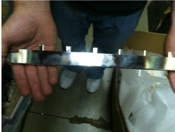
Exit Plate (Front View)

The New Exit Plates have a Notch cut out for Ground Sensor.